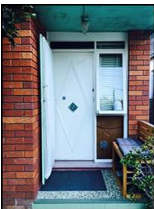
CHALLENGE ONE: The front door of your home