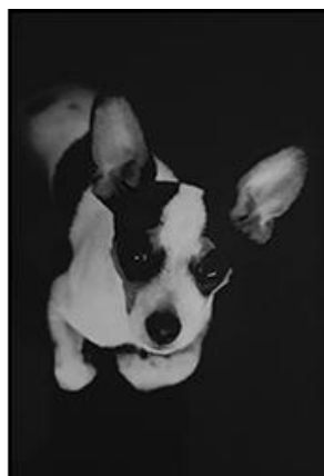
CHALLENGE TWO: A pet