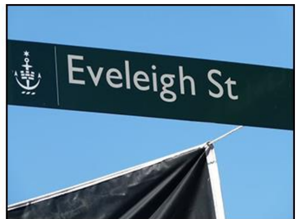
CHALLENGE THREE: Street Signs

Please note by submitting your work you are giving us permission to publish and use the work for Bradfield purposes